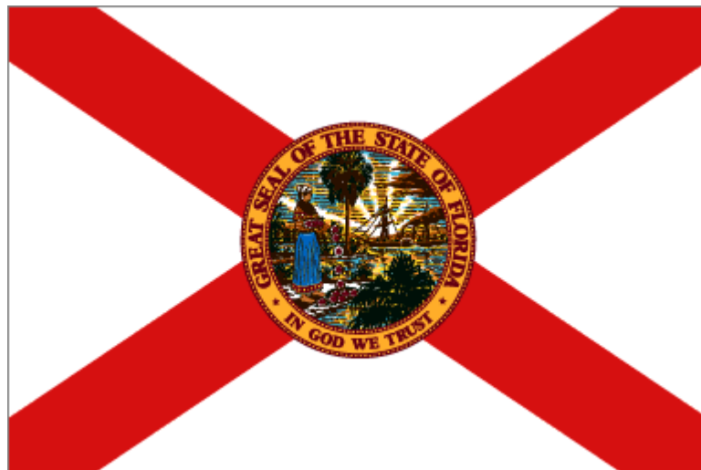
Plate 2. Florida State Flag

One is struck immediately by the fact that Waugh's words, set to the stirring " O Tannenbaum " music, had already been adopted by many of the state's public schools as part of the daily regimen. The Florida legislature undoubtedly observed that the song promoted love for home and state and, consequently, recommended (but did not require) that it be sung not only in the school setting but also at "all public gatherings where singing forms part of the program." Prior to the time in which the song "officially" served the citizenry, the Florida State Flag (see Plate 2) was adopted by Joint Resolution No. 4, Legislature, 1899, and ratified in the general election of 1900. The State Flower, the orange blossom, was so designated by Concurrent Resolution No. 15, Legislature, 1909, and the State Bird, the mocking bird (see Plate 3) was so declared by Senate Concurrent Resolution No. 3, Legislature, 1927.