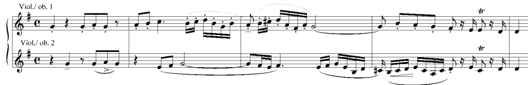
Example 2 Et in Unum , bars 1-5, in Hengelbrock’s recording ( audio example 2 ) 16

The distinctive articulation of the two canonic parts is maintained throughout the ritornello, in all its appearances. 17 This is set against a background more neutral non-legato articulation, and comparatively stable dynamics, in the lower parts. Outside the ritornelli, the predominant articulation is legato , albeit in distinct phrase groups (for example, the \text{♩} \text{♩} \text{♩} \text{♩} | \text{♩} figure is phrased legato internally, but its appearances are clearly separated from one another).