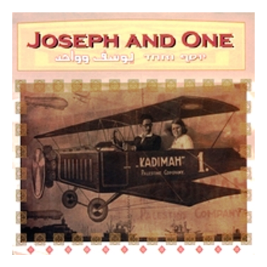
Fig. 2. Joseph and One's CD cover.

Audio sample nr. 2: "Kadima" from Joseph and One's 2001 album Kadimah.