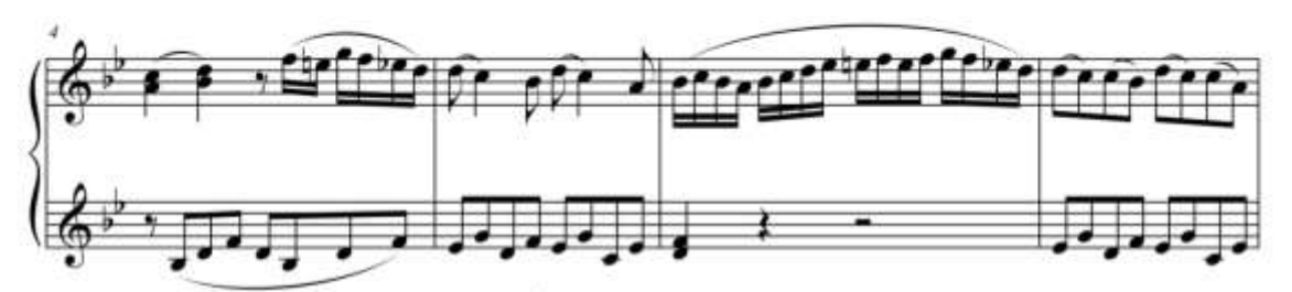
Example 1 Mozart, Sonata in B-flat Major, K333, beginning of first movement