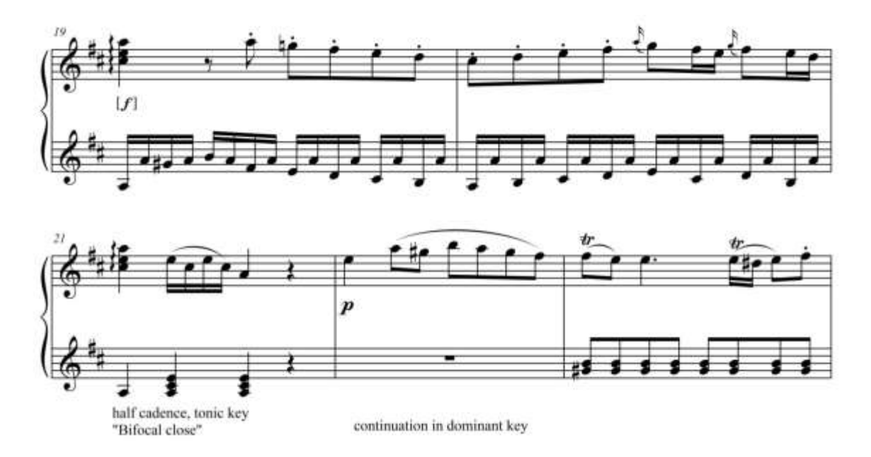
Example 3a Mozart, Sonata in D Major, K. 284, first movement, mm. 19-23