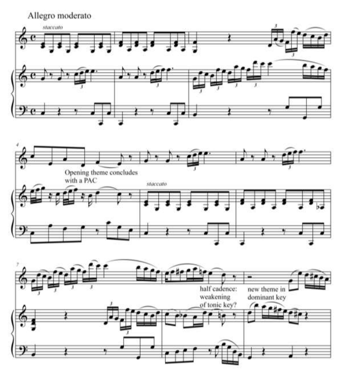
Example 2 Mozart, Sonata for Violin and Piano in C Major, K. 403. Beginning of first movement

The example Caplin provides as an illustration of a non-modulating transition is the beginning of the first movement of Mozart's Sonata for Violin and Piano in C major, K. 403 (see Example 2).