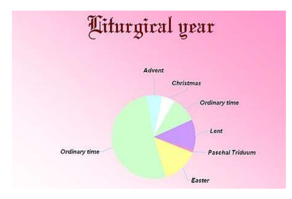
Figure 2 Liturgical year<sup>28</sup>

In order to compose a basic calendar, an average quantity of numbered weeks was taken for both per annum periods, i.e. 5 weeks for the first and 24 weeks for the second. (Figure 2).