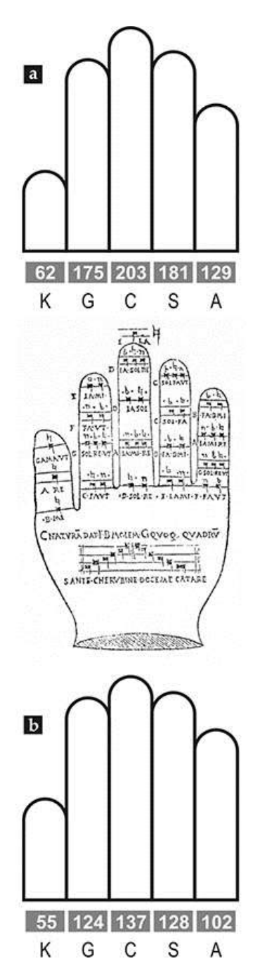
Figure 1. Computer pictures of the overall design in the 15^{\text{th}} century masses: a – J. Ockeghem Caput ; b – A. Busnois L'Homme armé .

than being some abstract form, constituted a recognizable sacral symbol—the symbol of the hand<sup>5</sup> (Figure 1).